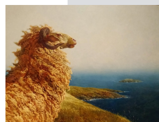
The Islander, 1975

Monhegan 2006, and The Islander, 1975, a portrait of a ram, looking like the island patriarch.