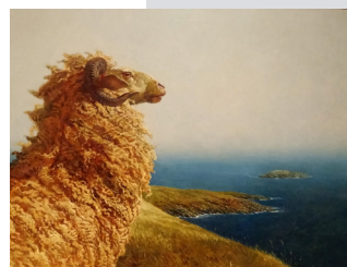
The Islander, 1975

Monhegan 2006, and The Islander, 1975, a portrait of a ram, looking like the island patriarch.