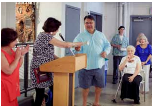
Reception