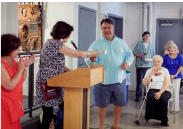
Reception photography by Amy Stauffer